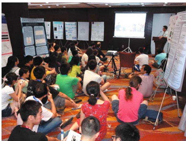
Opening night of PKU-UCSF Team Challenge Workshop

UCSF has experience in collaborative, team-based