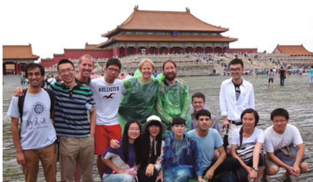
Workshop participants visit the Forbidden City in Beijing

We organized several team-based lunches and dinners such that the individual team members could get to know each other well during the course of the workshop. Other meals and social activities were interspersed to promote cross-team interactions, and on three evenings, all participants were together as one large group. In addition, all participants could participate in sight-seeing tours arranged in and around Beijing for two days following the workshop itself.